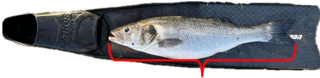
Figure 2. – Measuring fish

Most fish are measured from tip of head to end of tail. The exception to this is rays which are sometimes measured from wingtip to wingtip. Check with your local fishery authority for guidance on measuring rays in your area.