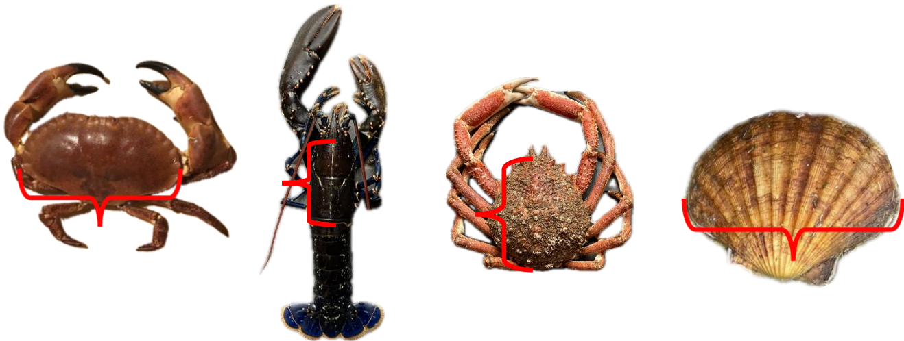
Figure 3. – Measuring shellfish

Scallop – measure diameter across the largest cross-section of the shell.