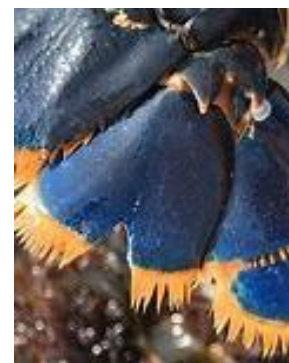
Fig.4 V-notched female lobster tail

V-notched lobster - In many areas the commercial potters (and some experienced recreational potters and spearfishers) “V-notch” berried females by cutting a wedge from a tail flap (see figure 4). This marks them as a breeding female and will remain in the shell through two moulting cycles – it is illegal to land a V-notched lobster, or a lobster with a damaged tail, and these must also be returned unharmed. Do not attempt to V-notch a lobster unless you have been trained to do so as you may cause it harm.